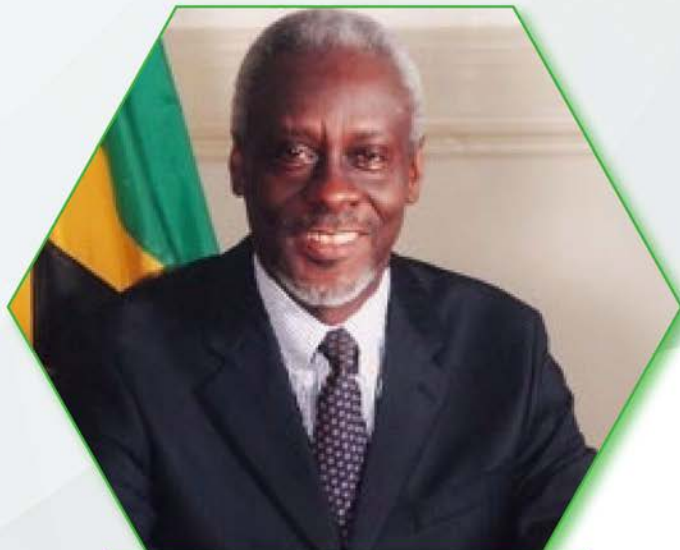
Percival James Patterson former Prime Minister of Jamaica