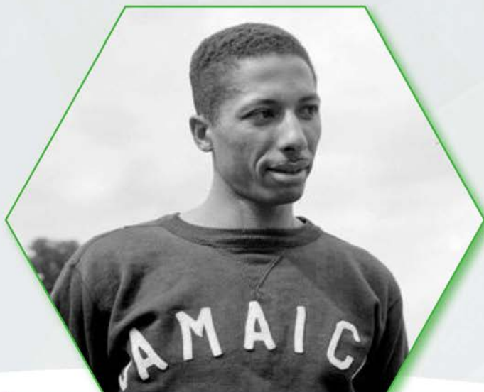
Herb McKenley Olympic Gold Medalist sprinter and former world record holder