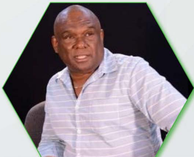
Colin Campbell former Minister of Government