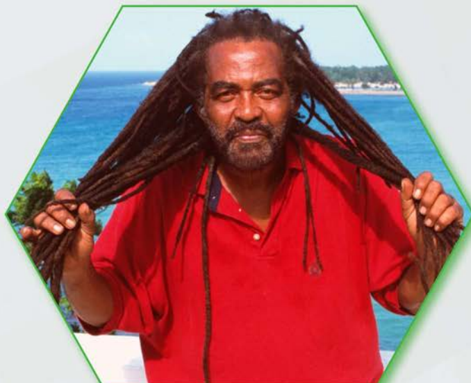
John Holt (Musician)