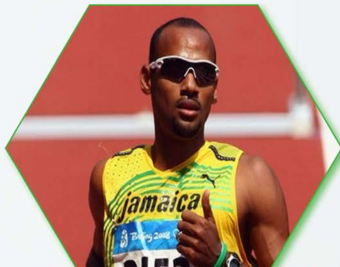
Maurice Wignall Commonwealth Games Gold Medalist