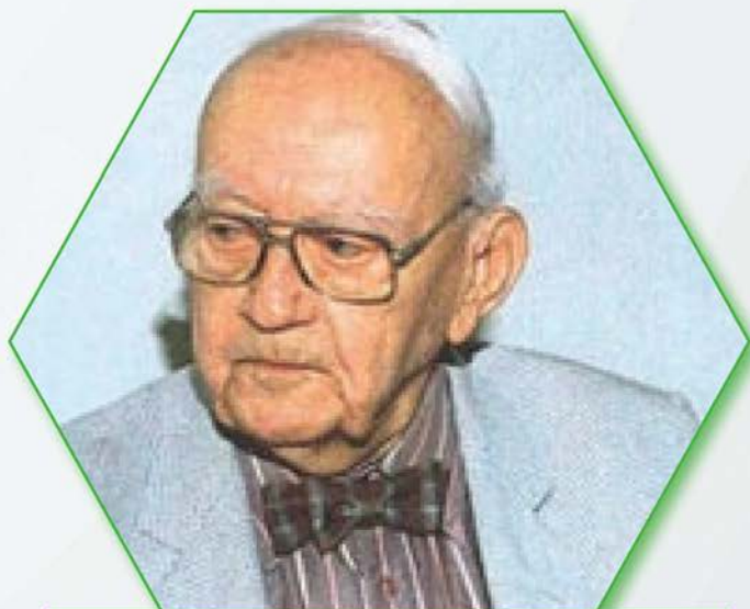
The Hon. Sir Phillip Sherlock KBE, OM, OCC