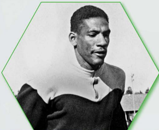
Arthur Wint, Olympic Gold Medalist runner and former world record holder