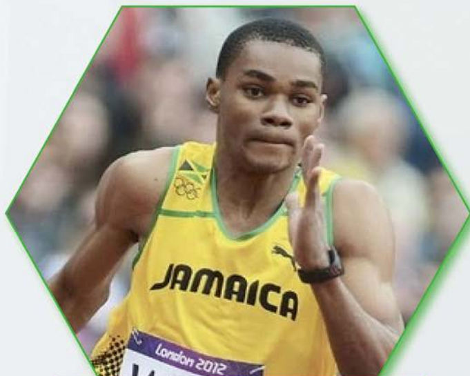
Warren Weir Olympic and World Championship Medalist